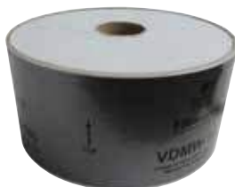
VDMW Element - Part code: VDMW-180