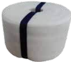
Cellulose Element: part code: SDFC (W2) Disc