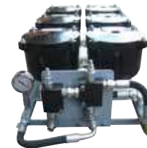
6 Hippo Configuration FTP-180-6