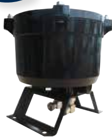
Hippo Filter - FTP 180