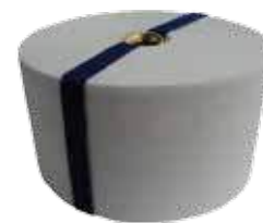
Polypropelene Element: part code: SDFC (W2P)