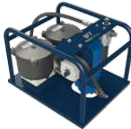
Twin Hippo Filter with SRLT option - BD5000