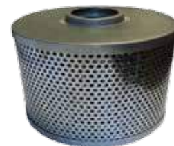
Pleated Element: Part code: MM4627-A1